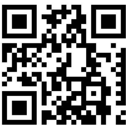
Scan QR Code for Rain Map